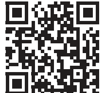
scan to pay on-line

Dillsburg Community Association (DCA), PO Box 359, Dillsburg, PA 17019