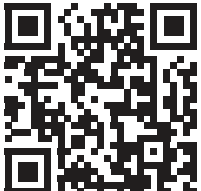
scan to pay on-line

----- Please fill out this typable application -----